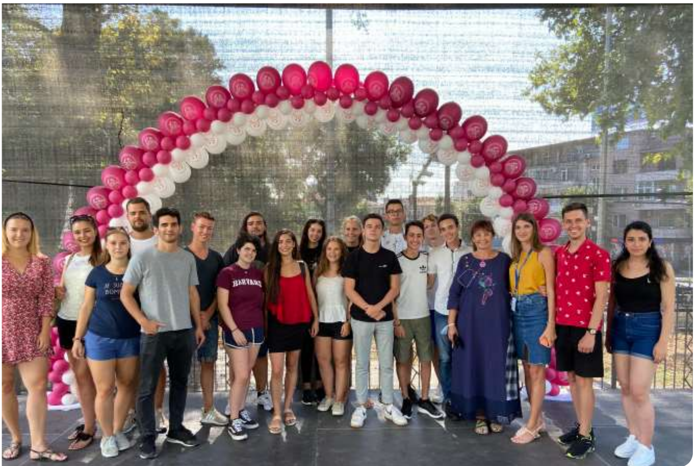
Incoming Erasmus+ Students 2020/2021 academic year