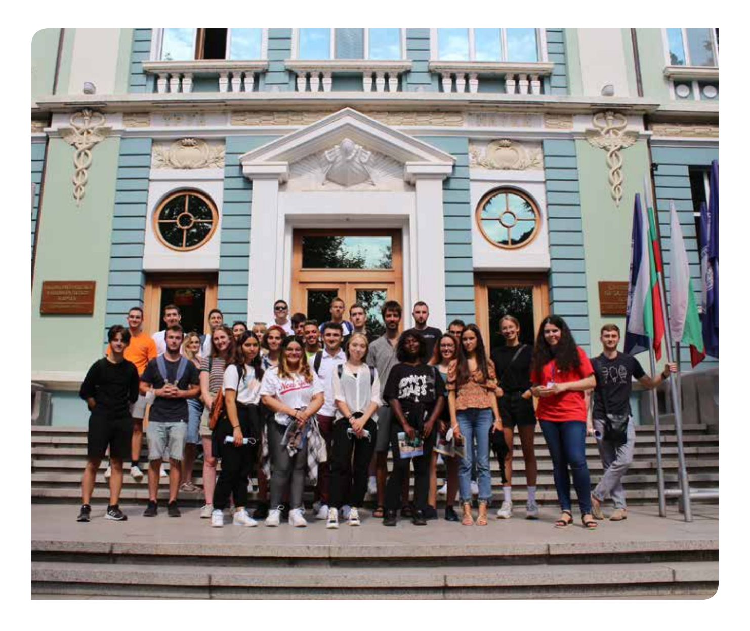
Incoming Erasmus+ Students 2021/2022 academic year